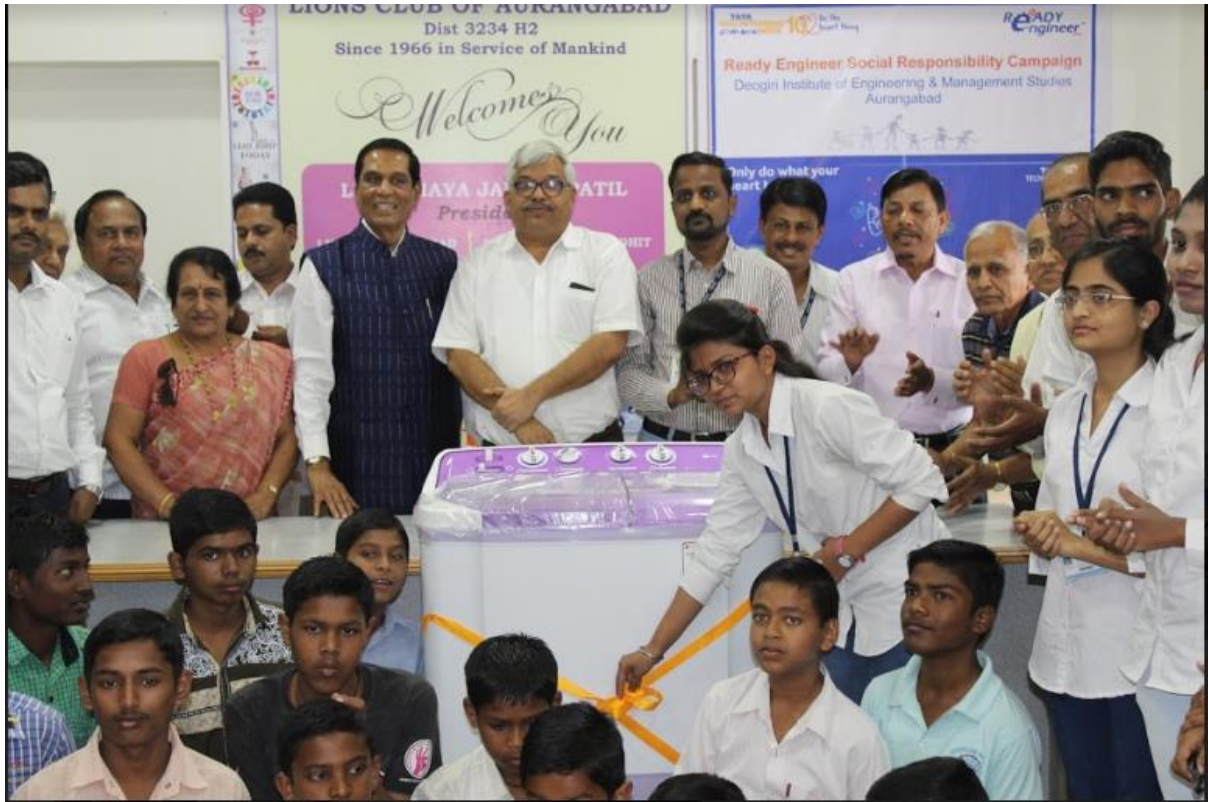
Donation of Washing Machine to Lions Club Aurangabad. 6 Teachers along with 50 Students participated in this social activity. (Social Activity) 2018-19 PART I