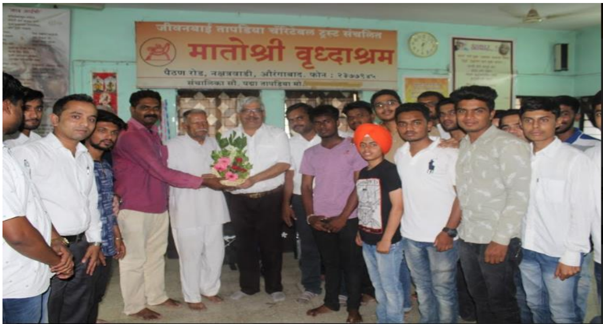
7 Teachers along with 80 Students donated three wheel chairs, ten Sticks and one month calcium tablets to Matoshri Old Age Home, Aurangabad