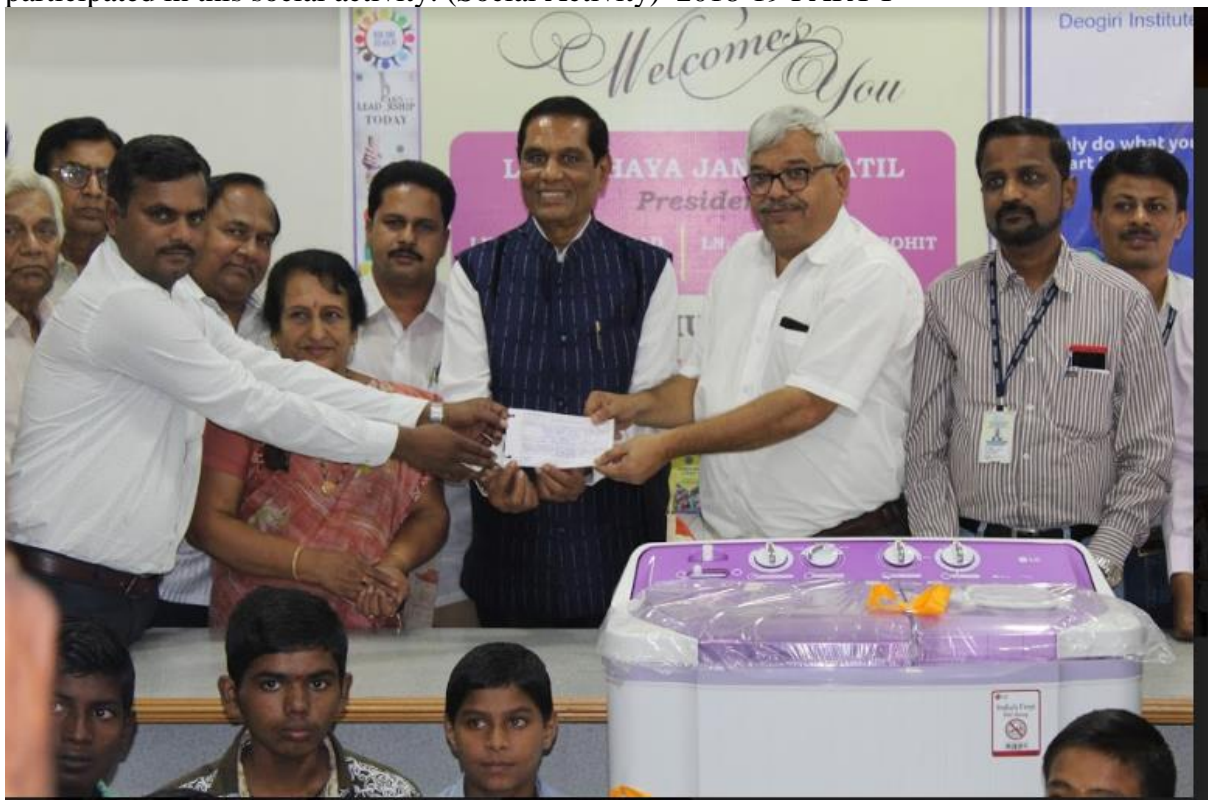
Donation of Washing Machine to Lions Club Aurangabad.