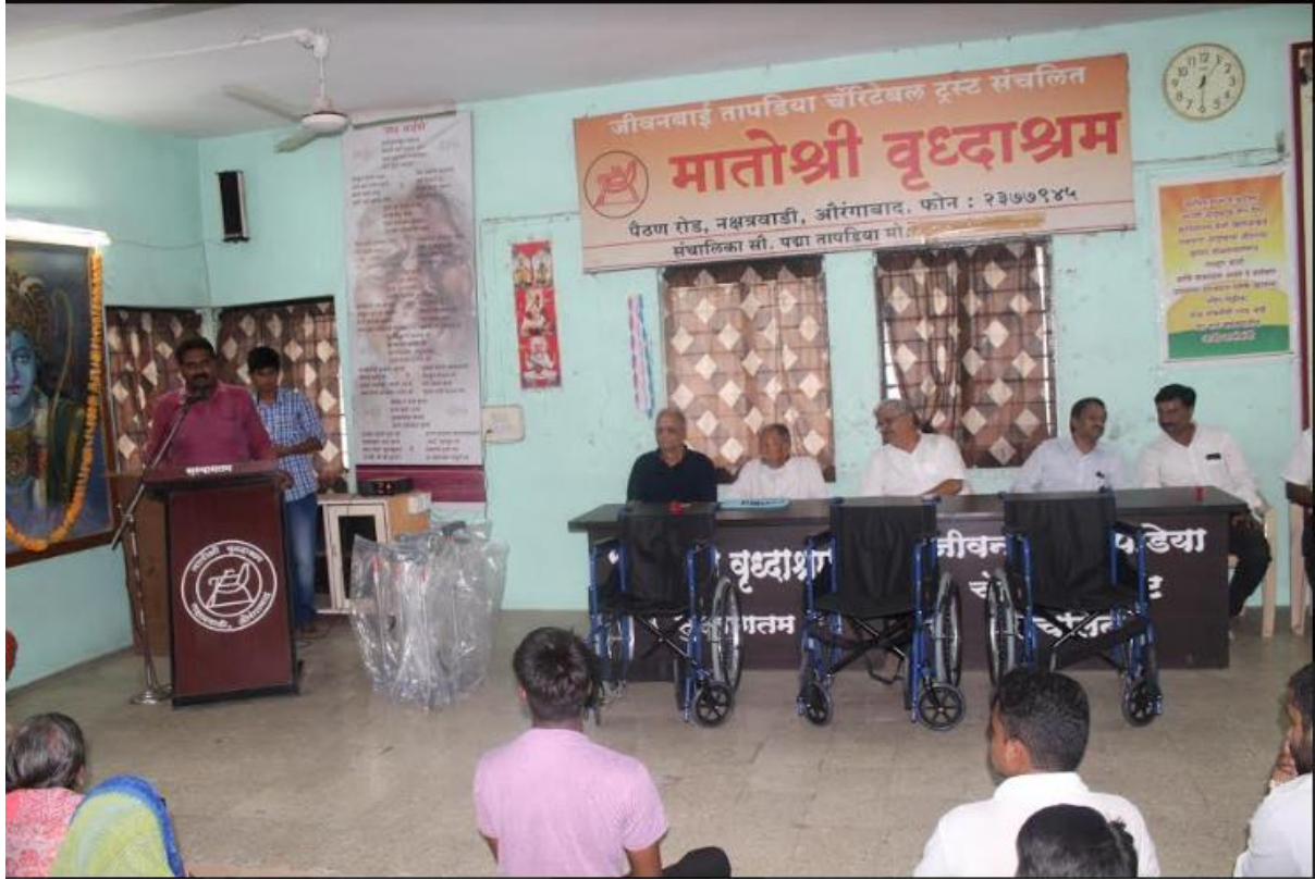
Donation of three wheel chairs, ten Sticks and one month calcium tablets to Matoshri Old Age Home, Aurangabad. (Social Activity Program) 2018-19 PART II