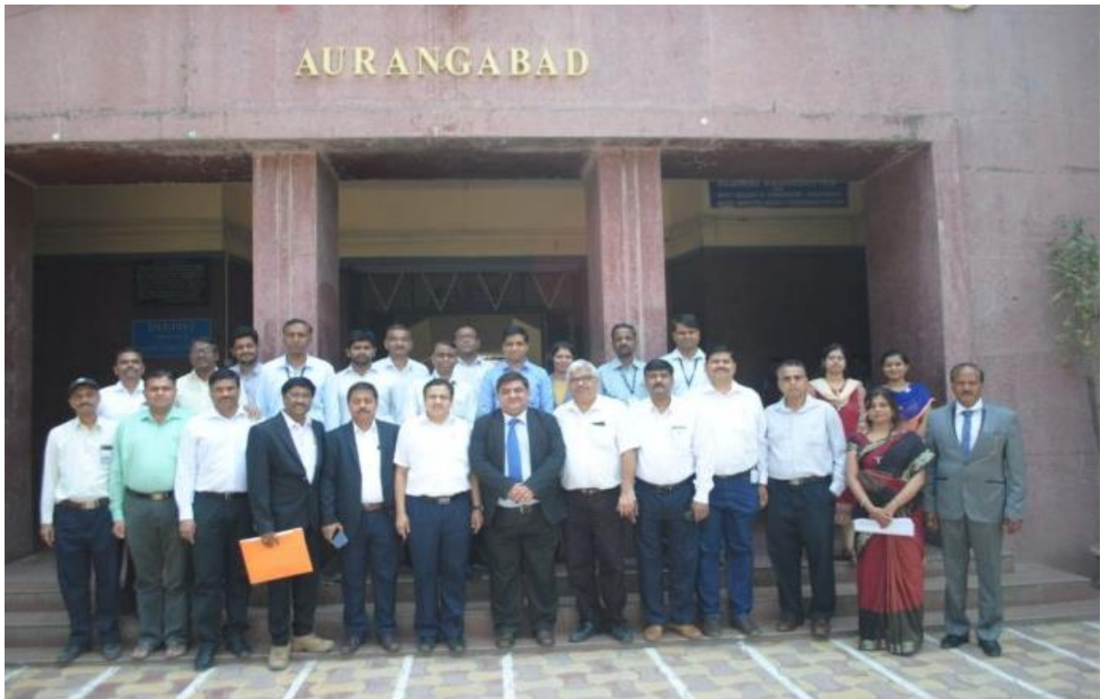
Tata Technologies expands its flagship Ready Engineer program to eight colleges in Aurangabad.